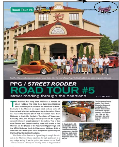
SR Magazine Tour Coverage- April 2007 issue