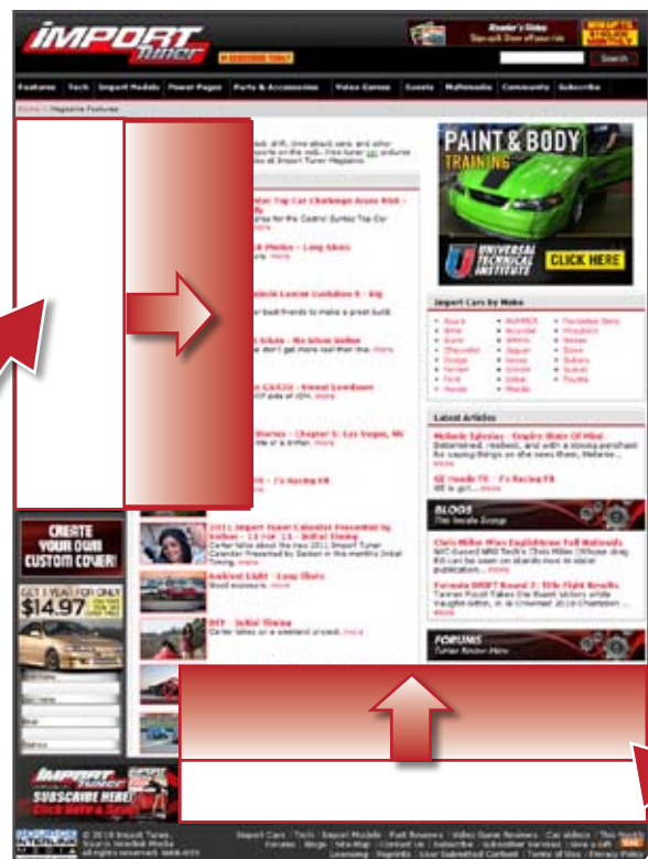
160x600 ad unit expands to max size 320x600 to the right on click